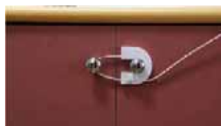
Examples of child resistant catches sold at Kidsafe